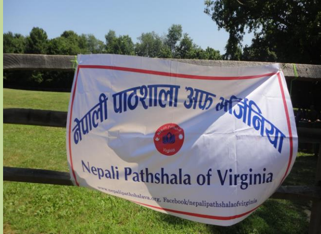
NEPALI Pathshala of Virginia