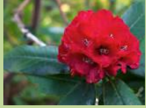
National flower of Nepal

We are very proud to have you all in our Nepali Pathshala. This is the journey we all are taking together where everyone is empowered to create a structural learning environment for our children and build a true and healthy relationship among us to serve the society where we live.