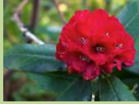
National flower of Nepal

तिमै सुन्दर हरियालीमा तिमै शीतल वक्षःस्थलमा यो कविको शैशवकाल बित्यो, हाँस्यो, खेल्यो, वन कुञ्ज घुम्यो मेरो प्यारो ओखलढुंगा!