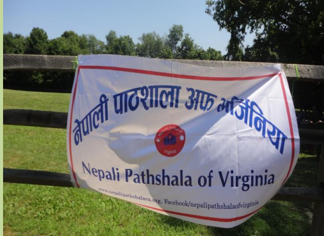
NEPALI Pathshala of Virginia